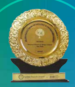
Award for Golden Peacock for Excellence in Corporate Governance - IOD, London