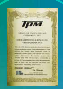
Award for TPM Excellence for Ghaziabad & Pathredi Plant - JPIM, Japan