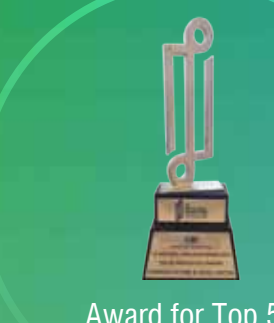
Award for Top 50 Innovative Companies - CII