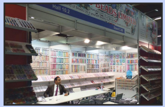
From Time to Time Company will participate Jewelry Fairs in various parts of worlds.